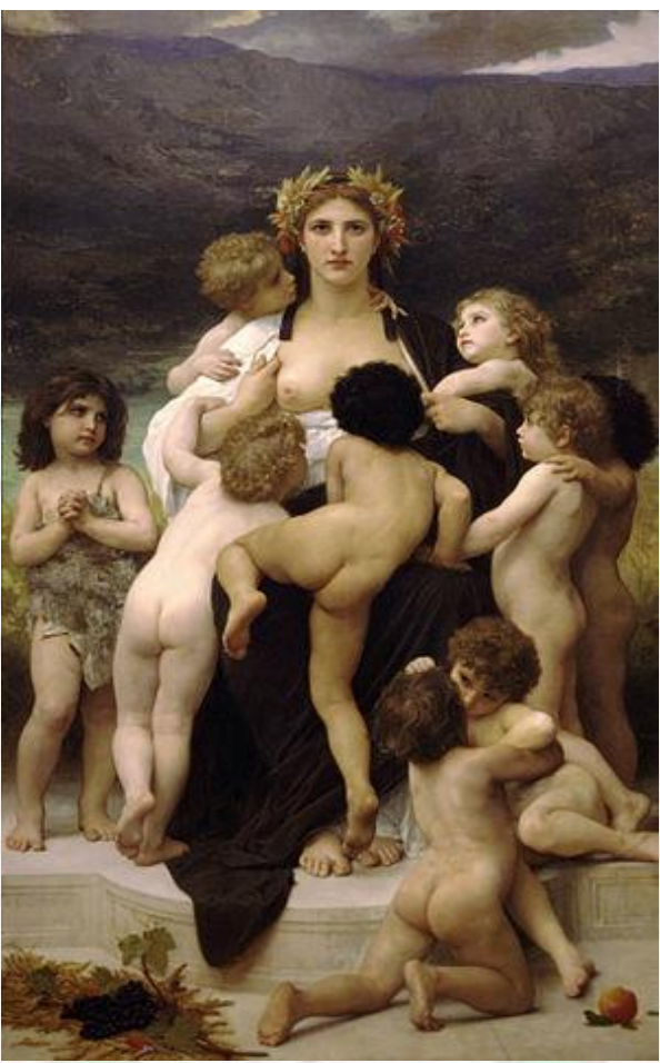
Image 2. The country is depicted as Mother and her dependents as the colonial offspring.